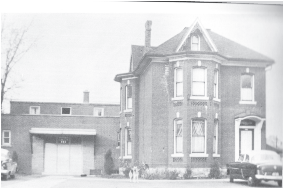
The Germania Club as it was in 1955, with the newly built large hall on the left