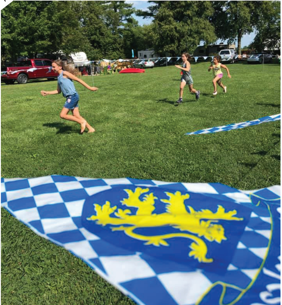
Athletes competing in the ‘Germania Olympics’ at last year’s Picnic”